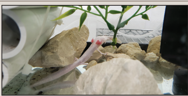
FIG. 3. Female Eurycea rathbuni cannibal from Primer's Fissure, Texas, USA attempting to consume her second documented conspecific. The salamander was extracted from her mouth and lived.

in the tank together. In the afternoon of 15 August 2018, one of these five E. rathbuni was discovered in the process of consuming another salamander. Approximately 1 cm of the victim's tail was protruding from the cannibal's mouth (Fig. 1). The victim was extricated from the cannibal's mouth, and it was noted that the head appeared to have already been mostly digested.