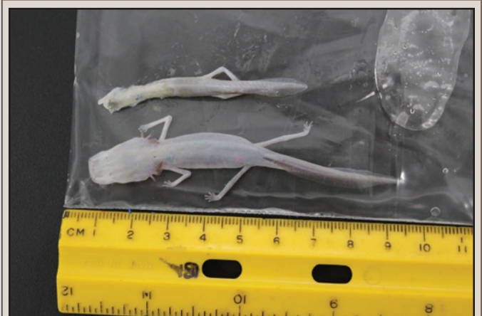
FIG. 2. Measurements taken of ER015 (bottom) and ER019 after it was extracted from ER015's mouth. There was a 15.68 mm difference between the two individuals.